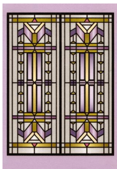
Frank Lloyd Wright